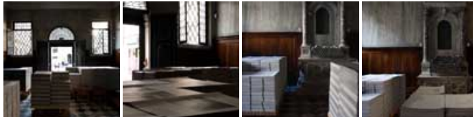
Venice Biennale Irish Pavilion